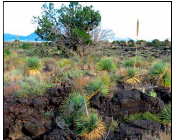
Lava beds at Valley of Fires