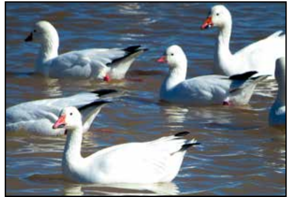
Snow Geese and a Ross's Goose

After breakfast we will head to the Bitter Lakes National Wildlife Refuge, just outside Roswell. This refuge encompasses more than 23,000 acres in the Pecos River Valley. Highlights will include Sandhill Crane, White