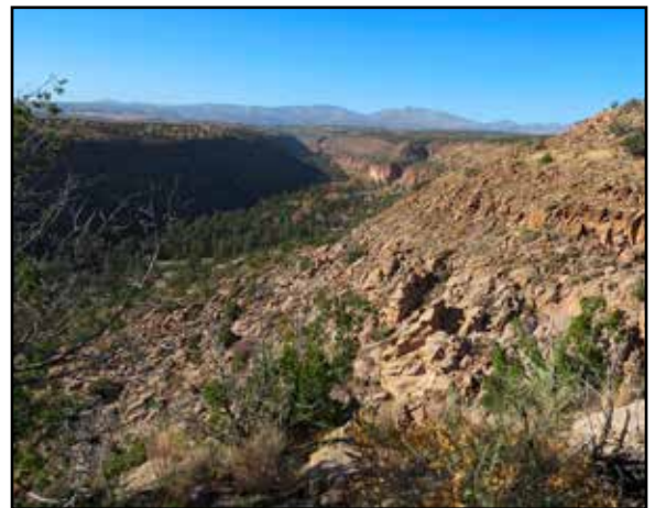
Bandelier National Monument