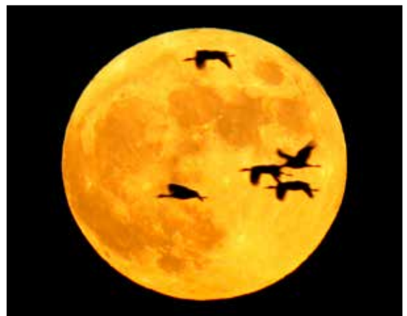
Sandhill Cranes at sunset